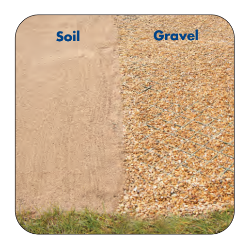
For further information on GroundGuard, please visit our website: www.floplast.co.uk